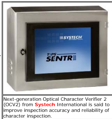
Next-generation Optical Character Verifier 2 (OCV2) from Systech International is said to improve inspection accuracy and reliability of character inspection.

Also read selections from the Machine Vision Resource Guide below.